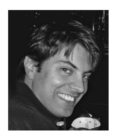
and undergraduate students.

been conducting studies about drug misusers' behavior and other studies emphasizing religiosity as a relevant drug use prevention and treatment factor since 1999. She also works in pro bono drug use prevention programs in slum areas of Sao Paulo city.